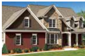
HAVEN® INSULATED SIDING