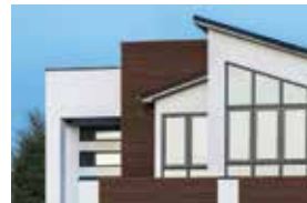
CEDAR RENDITIONS™ ALUMINUM SIDING