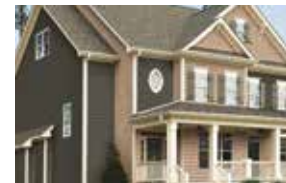
ROYAL® SHUTTERS, MOUNTS & VENTS