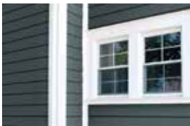
ROYAL® TRIM & MOULDINGS