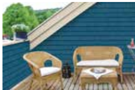
PORTSMOUTH™ SHAKE & SHINGLES