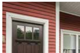
ROYAL® VINYL SIDING