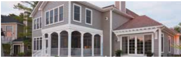
CELECT® CELLULAR COMPOSITE SIDING