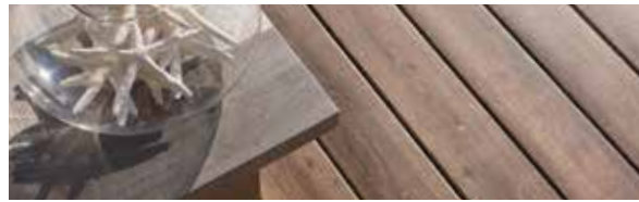
ZURI® PREMIUM DECKING