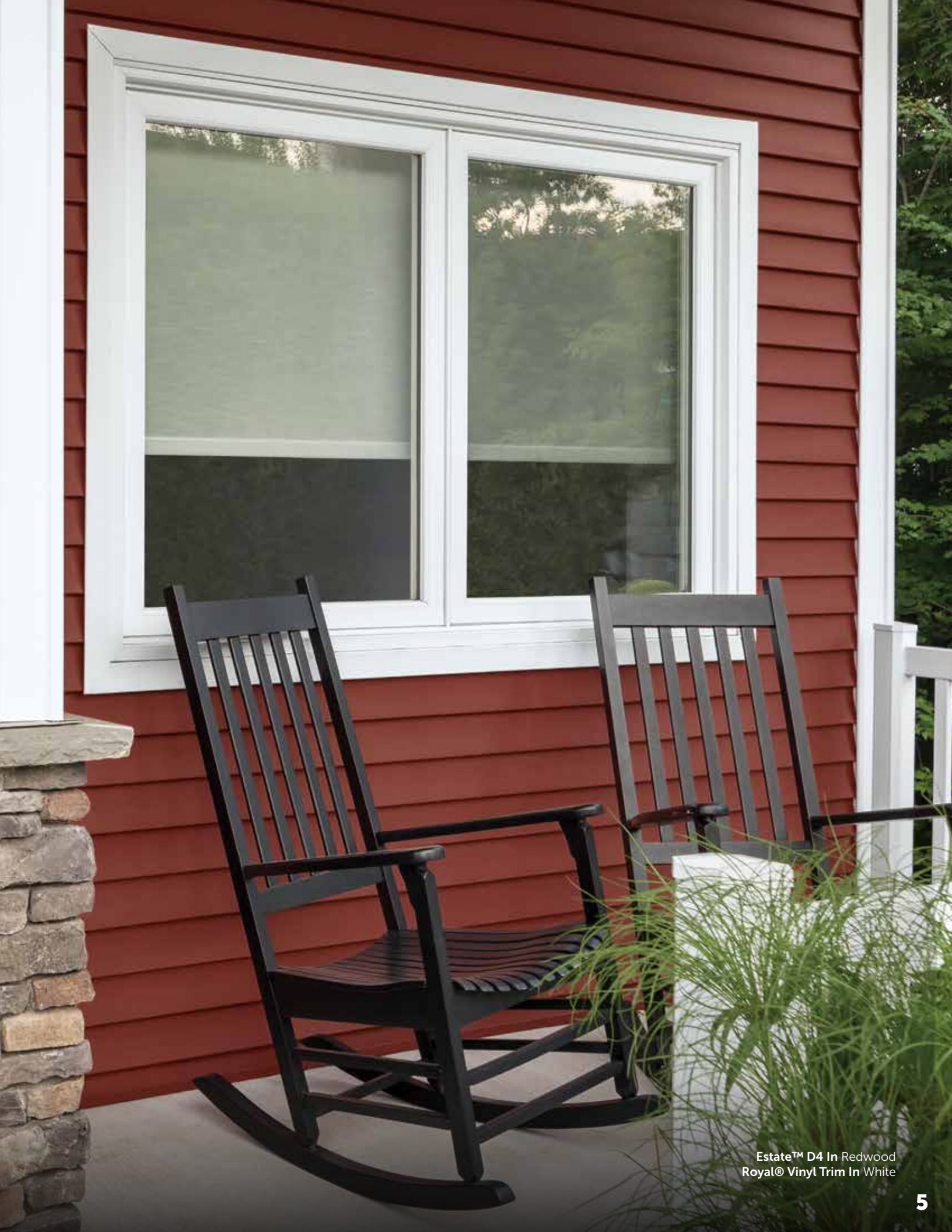
Estate™ D4 In Redwood Royal® Vinyl Trim In White