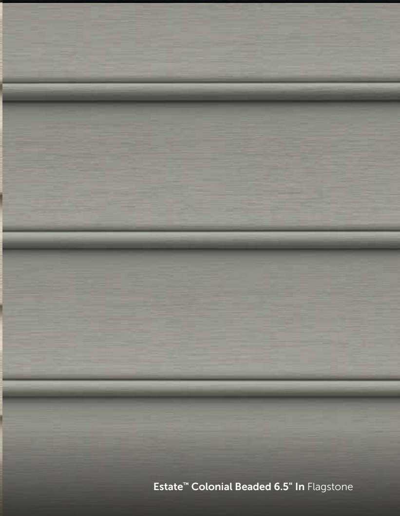
Estate™ Colonial Beaded 6.5" In Flagstone