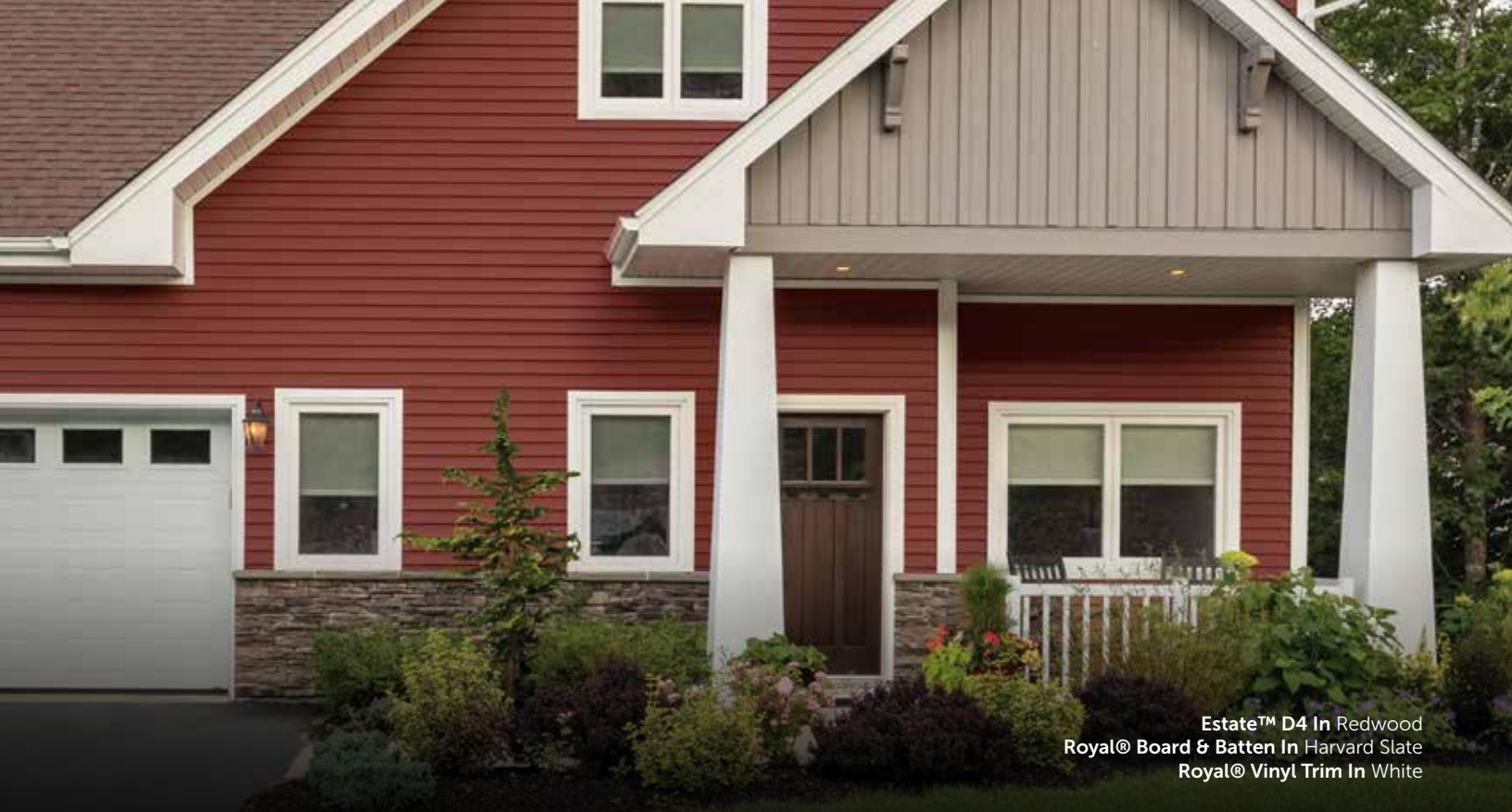
Estate™ D4 In Redwood Royal® Board & Batten In Harvard Slate Royal® Vinyl Trim In White