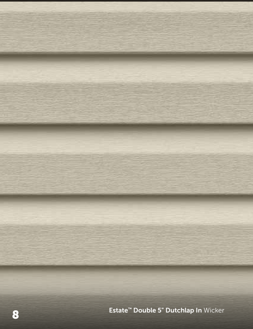
Estate™ Double 5" Dutchlap In Wicker