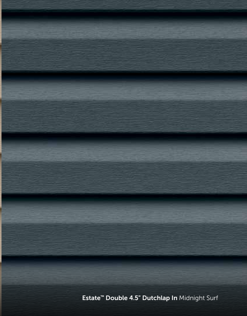
Estate™ Double 4.5" Dutchlap In Midnight Surf