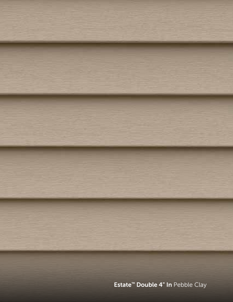
Estate™ Double 4" In Pebble Clay