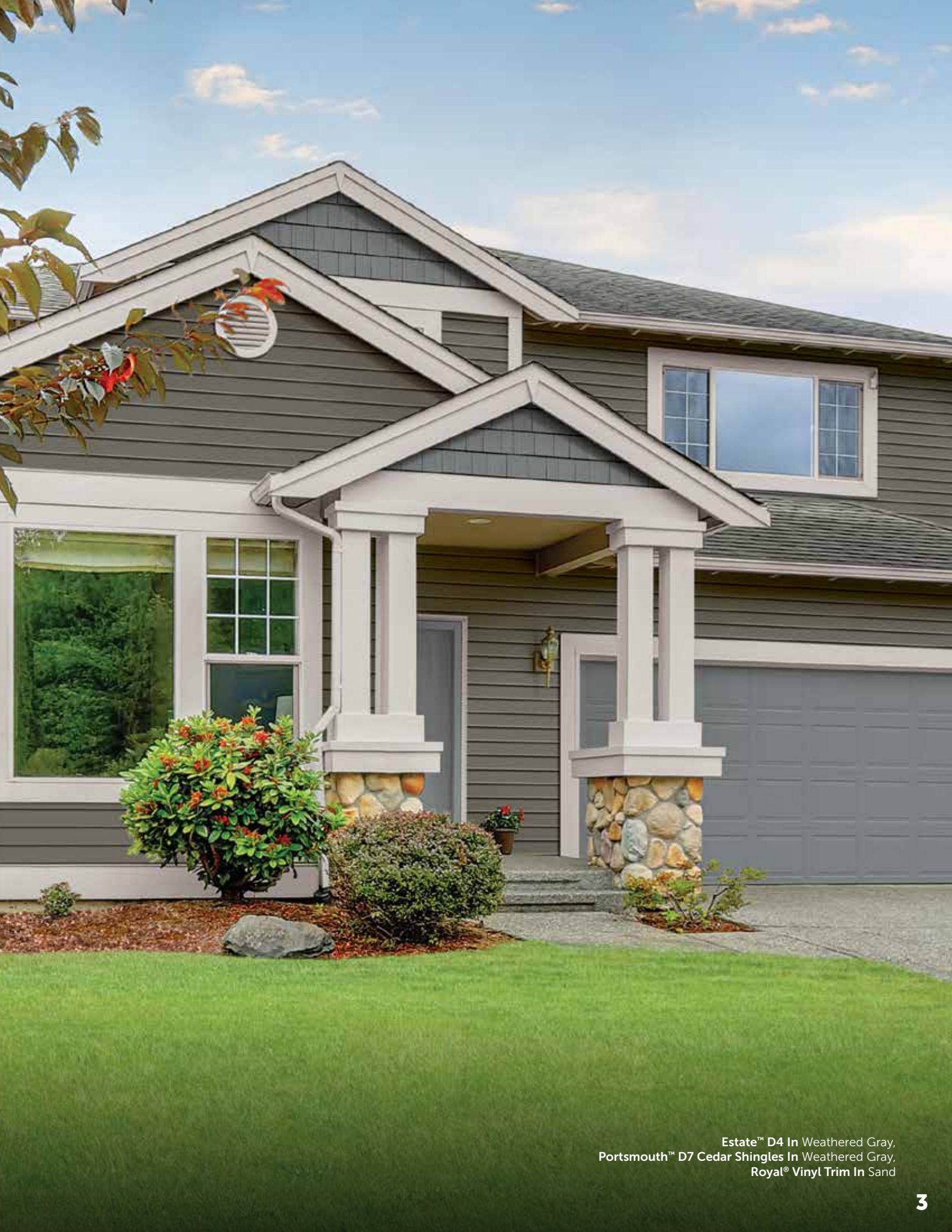
Estate™ D4 In Weathered Gray, Portsmouth™ D7 Cedar Shingles In Weathered Gray, Royal® Vinyl Trim In Sand