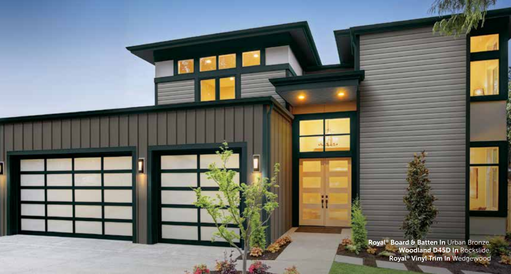
Royal® Board & Batten In Urban Bronze, Woodland D45D In Rockslide, Royal® Vinyl Trim In Wedgewood